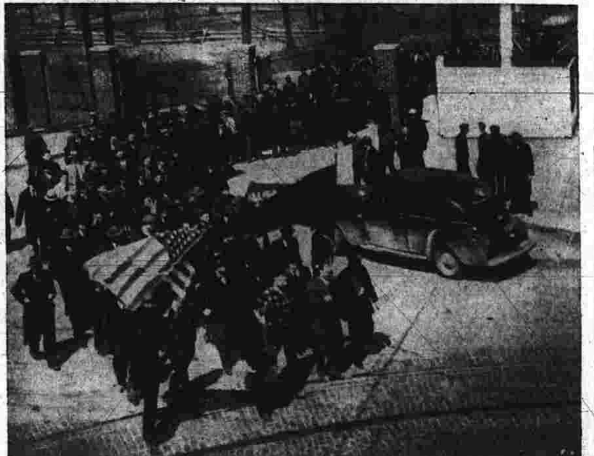
Several thousand CIO workers, jubilant at the end of the 74-day Allis-Chalmers strike, formed a parade in Milwaukee after ratifying a settlement reached at a Defense Mediation Board conference in Washington the day before.